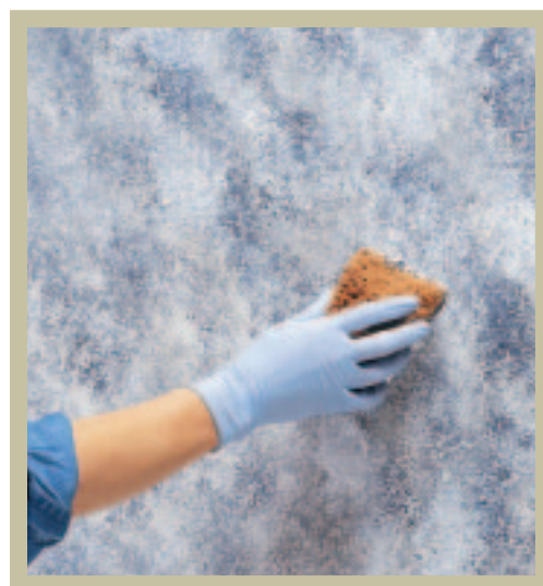
Special Effects Base Coat shown in Humble Gray with Sand Tones in River Shale and Slate Blue Translucent Color Glaze and Lime Wash

Another exciting technique is to sponge Textured Lime Wash, Sand Tones and Translucent Color Glaze over the dry Base Coat. It's an incredible textured effect.