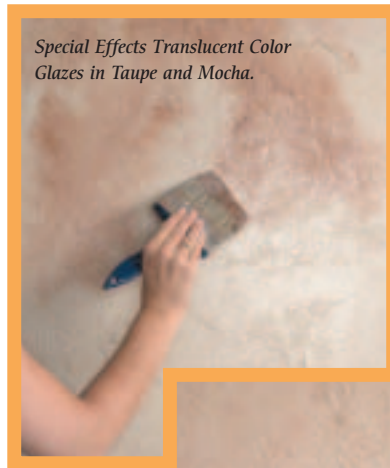
Special Effects Translucent Color Glazes in Taupe and Mocha.

Use Special Effects Translucent Color, Pearl, Opal or Metallic Glazes to add highlights. The Color Washing technique is recommended. Apply glaze in a random "X" pattern. (See the Color Washing brochure for complete details.) For large areas, roll on a light coating of glaze using a 3/8" nap roller cover. Before the glaze dries, blend in a second glaze color using a Symphony™ Color Washing Brush to eliminate lap marks. Soften the glaze with a Symphony™ Cheesecloth, Softening Brush, or cotton cloth.